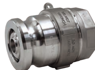
adapter x 1½" and 2" female NPT