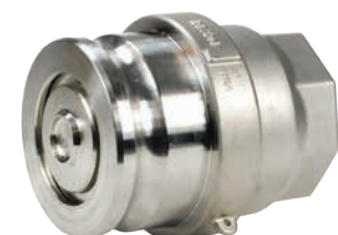
adapter x 3" female NPT